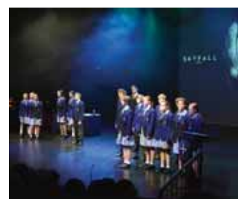
Damascus College Choir