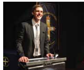
Jordan Roughead (2008)