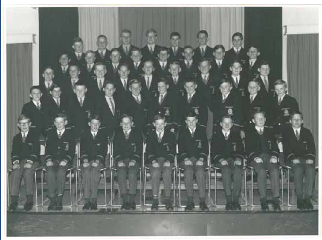
ST PAUL'S TECHNICAL COLLEGE - FORM 3, 1967