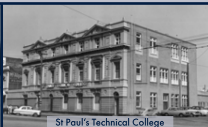
St Paul's Technical College