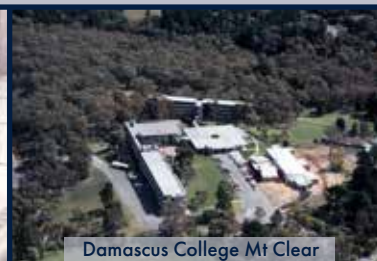
Damascus College Mt Clear