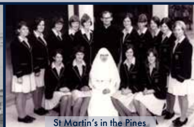
St Martin's in the Pines