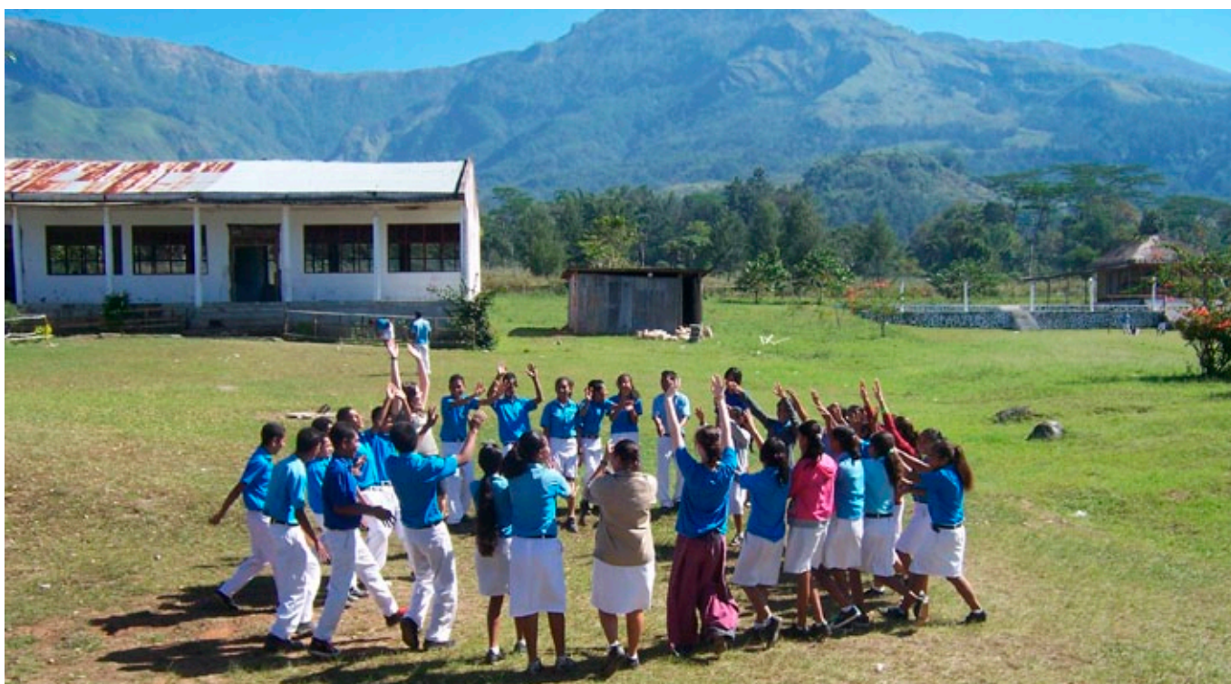
Photo: Teaching the Hokey Pokey