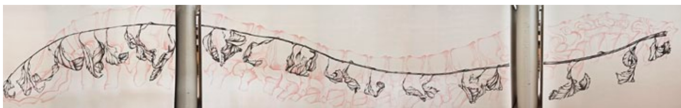
Lateral View of the Spine